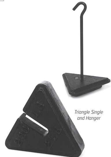
Triangle Single and Hanger