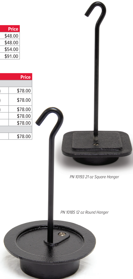
PN 10193 21 oz Square Hanger