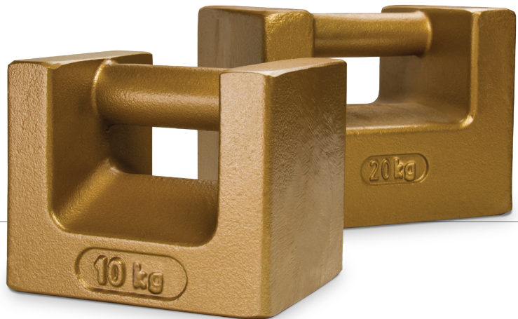
PN 12767 and PN 12771 OIML Grip-handle