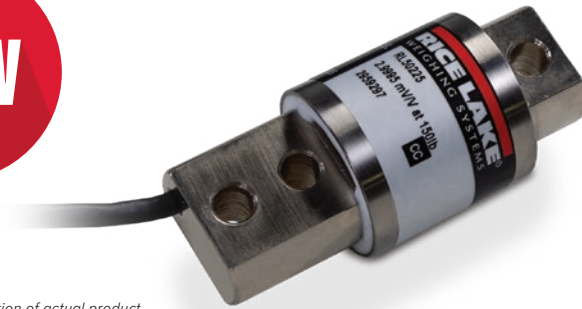
Picture is a representation of actual product.