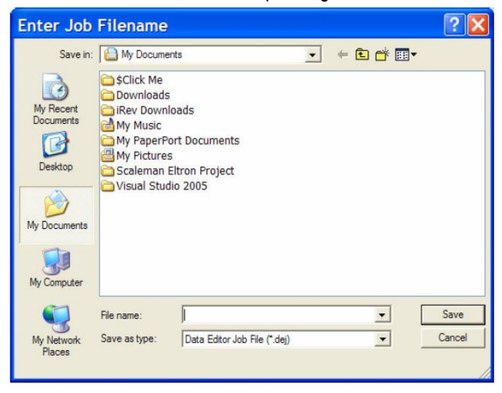
Figure 8. Job Filename Location

11. Enter the desired Job Filename and the desired Location, pressing Save when done.