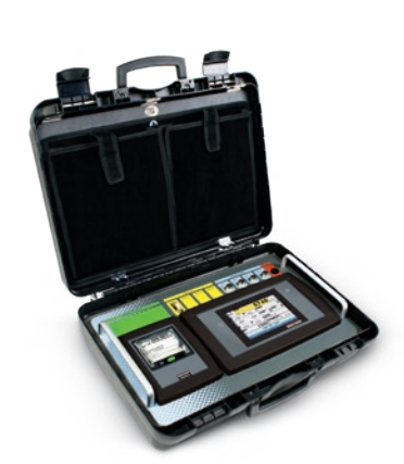
Load Ranger Indicator