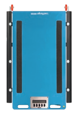
RF-WD 2 FT 6 IN X 1 FT 10 IN X 2.28 IN CAPACITY: 13,000 LB - 33,000 LB