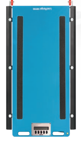
RF-XWD 3 FT 1 IN X 2 FT X 2.28 IN CAPACITY: 13,000 LB - 44,000 LB