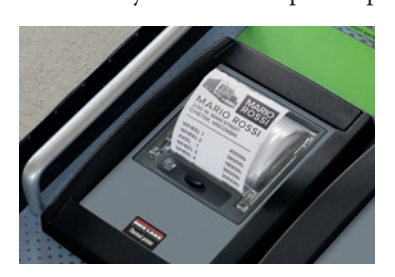
Thermal Printer Fully customizable ticket options

To simplify operation, Load Ranger wheel weigh pads can be paired with a touchscreen digital weight indicator and thermal printer in an ABS plastic transport case. This all-in-one solution allows remote weight summing of wheel pads to capture wheel or axle weights, either individually or in sets of up to 14 pads.