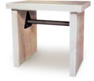
Provides the most stable surface possible for precision instruments. Legs are reinforced with support pipe.