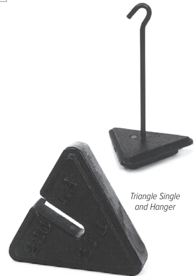
Triangle Single and Hanger