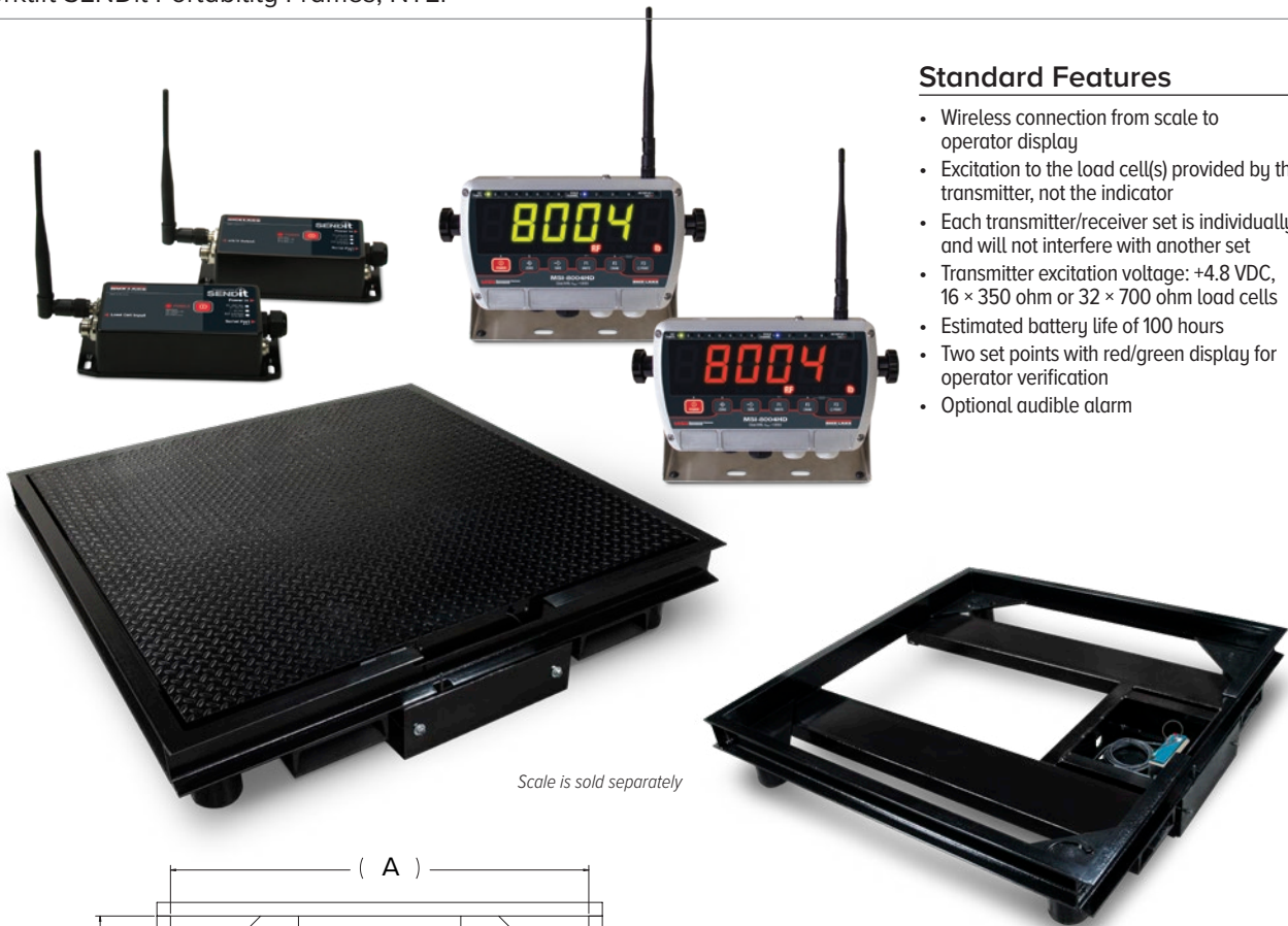
Scale is sold separately