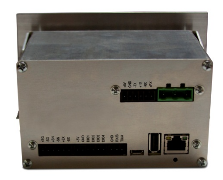
Back of panel and din rail mount with Ethernet port