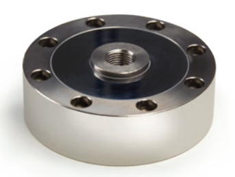
25,000 lb - 100,000 lb