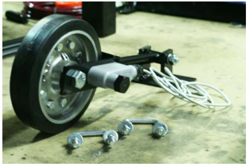
Figure 1. Speed Wheel

The signal generated by the speed wheel is converted by the integrator into a value representing the belt travel distance.