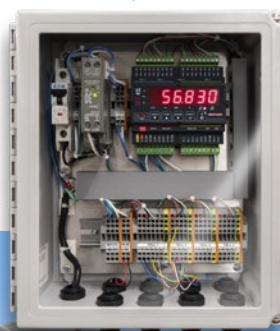
Shown with optional enclosure

Display system messages such as calculated flow rate, belt speed and reset totalizer memory (saved in the SCT-4XD memory).