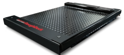
Shown with optional backstop

NTEP 03-060, Class III 2,500 d Measurement Canada AM-5578 (500 kg) Class III 2,500 d (1,000 kg) Class III 2,000 d