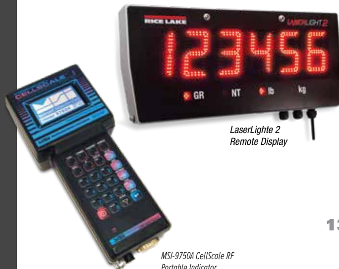
LaserLight 2 Remote Display

The 1280 Enterprise Series programmable indicator delivers uncompromising speed for today's operations and expansive options for tomorrow's requirements. A durable color touchscreen with a seven-inch or 12-inch LCD display integrates data with real-time analysis, enabling operators to optimize operations and leverage actionable information. Crisp visuals bring instant access to frequently used functions. Program multiple screens with custom graphics and softkeys for an interface that is designed for your process.