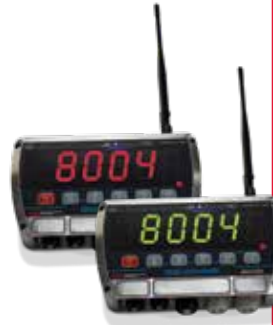
Shown with optional red/ green LED display

The MSI-8004HD has all of the heavy duty versatility of the MSI-8000HD with the added benefit of extreme high visibility in indoor and outdoor applications. The MSI-8004HD features 1.5-inch high characters on its LED display. The display is available in either red or green allowing the controller to be clearly visible in many environments. The red/green display can be configured to change color based on weight and setpoint conditions, making the MSI-8004HD a natural fit for safety-critical industrial applications.