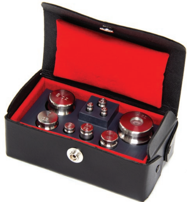
PN 12623 4 oz to 1/32 oz