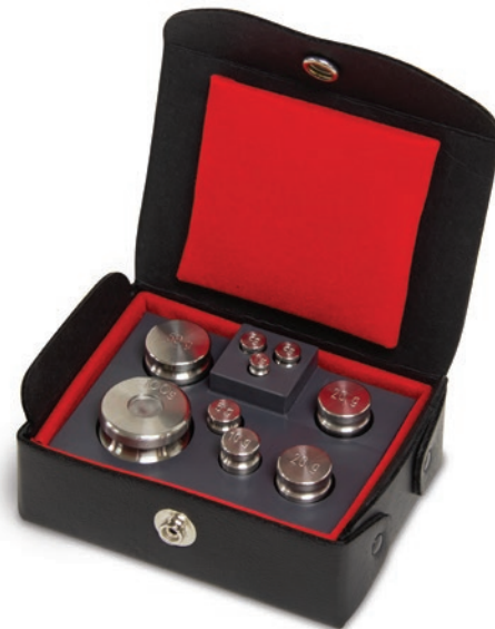
PN 12506 100 g to 1 g