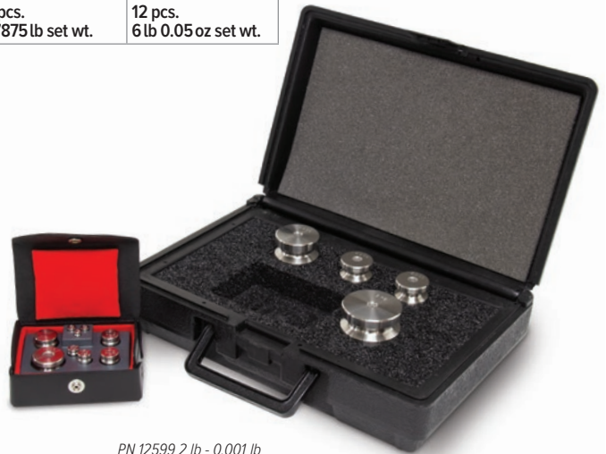
PN 12599 2 lb - 0.001 lb