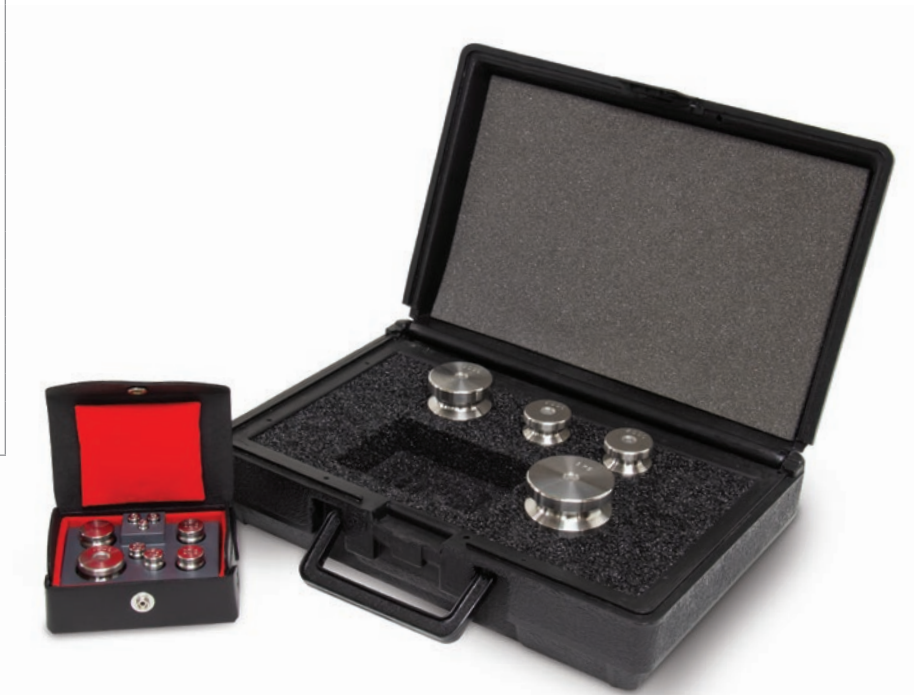
PN 12518 1kg to 1g