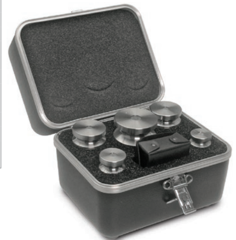
PN 12528 2 kg to 1 mg