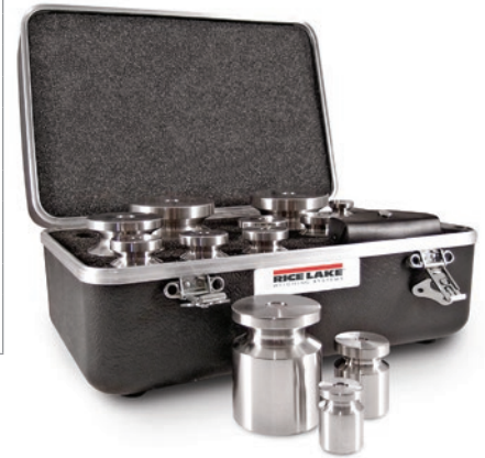
PN 12542 (2) 5 kg to 1 mg