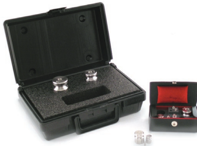
PN 12591 1 lb to 1/32 oz