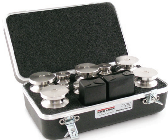
PN 12582 5 lb to 0.001 lb