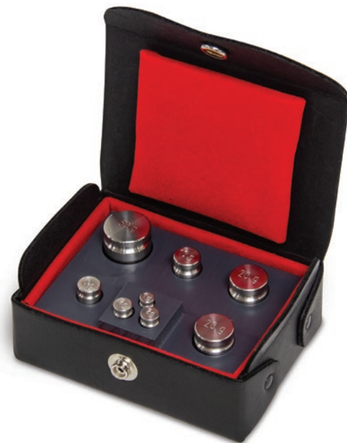
PN 12500 50 g to 1 g