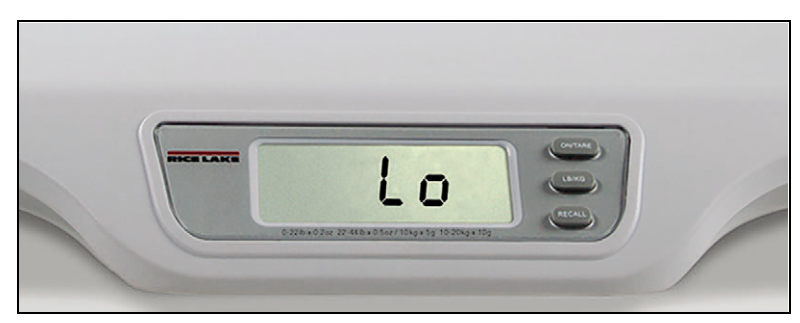
Figure 2-2. Low Battery Indicator

The RL-DBS-2 can also be powered by four AA alkaline batteries if an additional power source is not available. A battery powered scale automatically turns off after two minutes of not being used to save battery life. Replace the batteries or connect to an AC power source as soon as possible if the low battery indicator ( Lo ) displays.