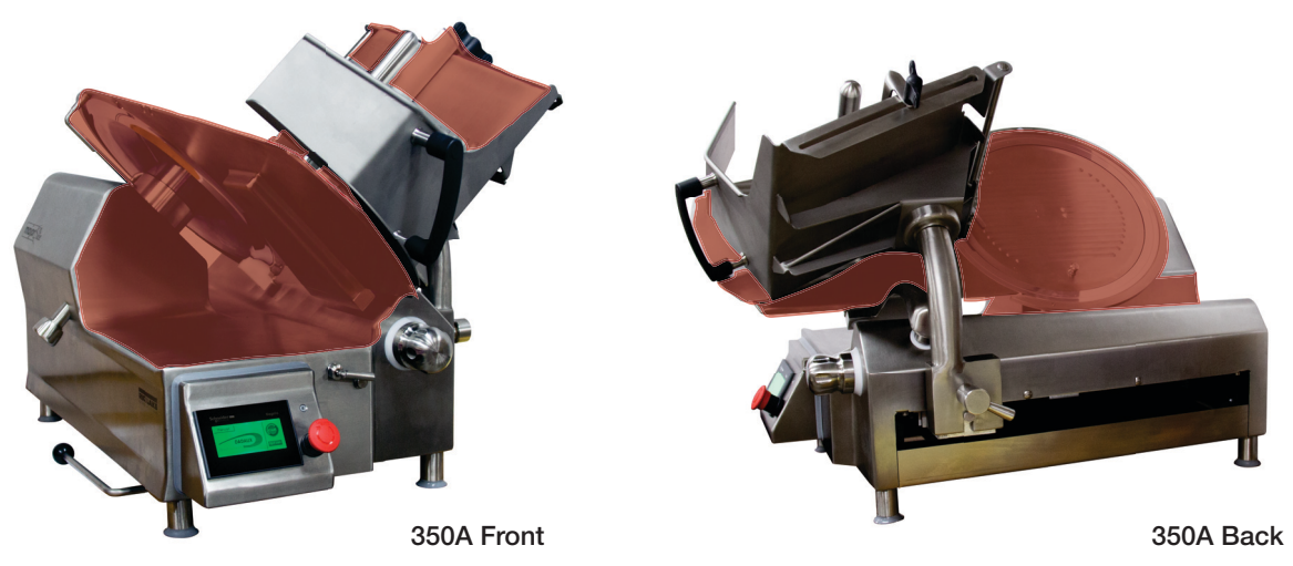
Figure 2. Food Zone

The sharpener assembly may be submerged in warm soapy water and the stones can be cleaned with a brush. Then rinse and allow to air dry before using. If sharpening is required, sharpen the knife after cleaning product from the machine and knife. See sharpening instructions in the Operator's Manual.