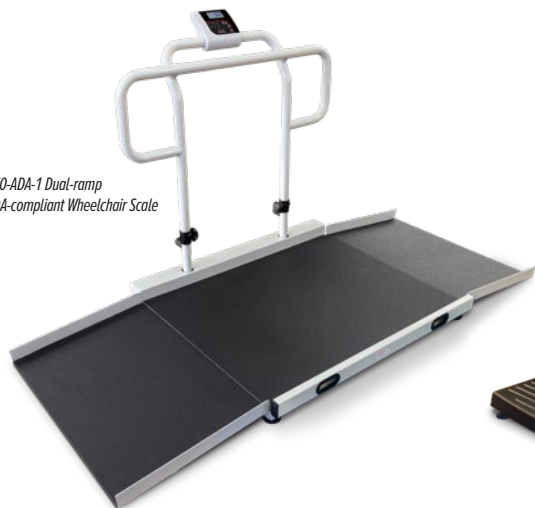
350-ADA-1 Dual-ramp ADA-compliant Wheelchair Scale