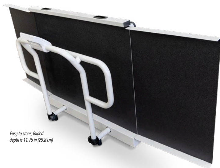
Easy to store, folded depth is 11.75 in (29.8 cm)