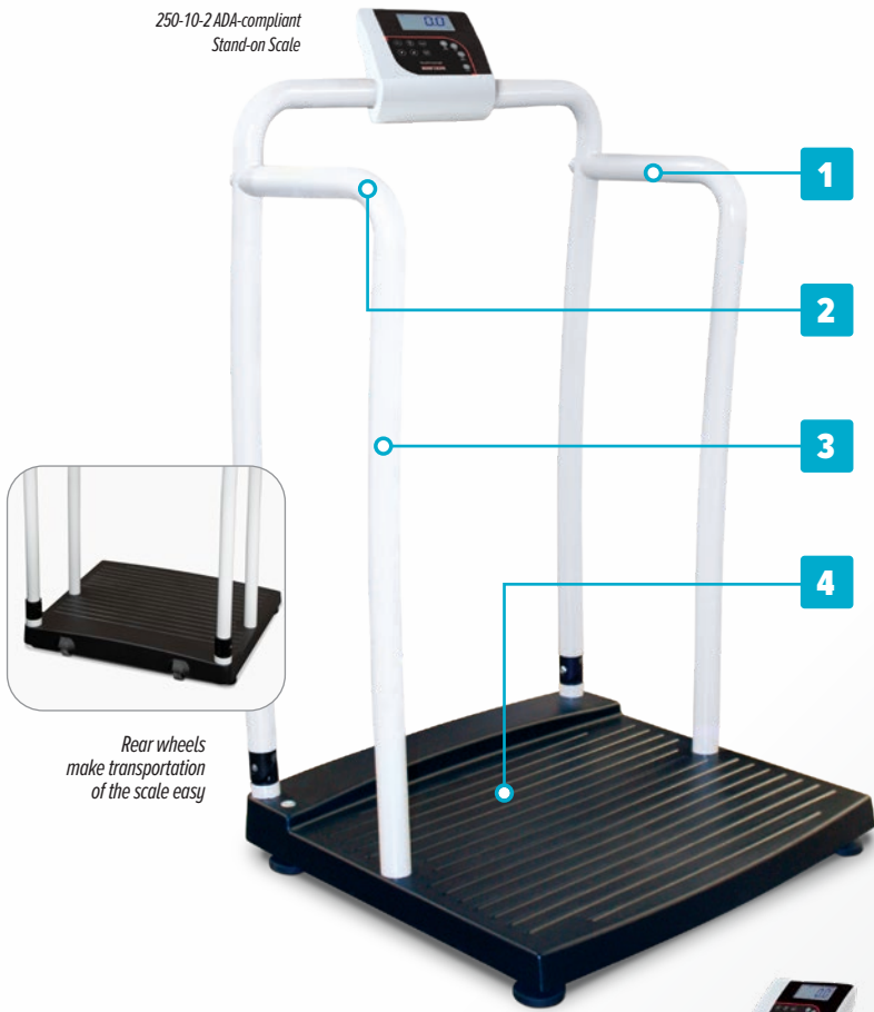
Rear wheels make transportation of the scale easy