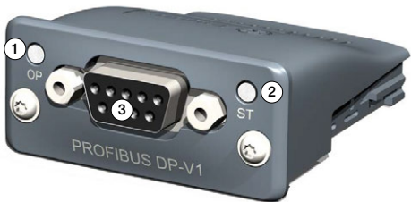
Figure 2-5. Profibus DP Status LED Module