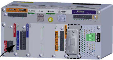
Installed Option Card