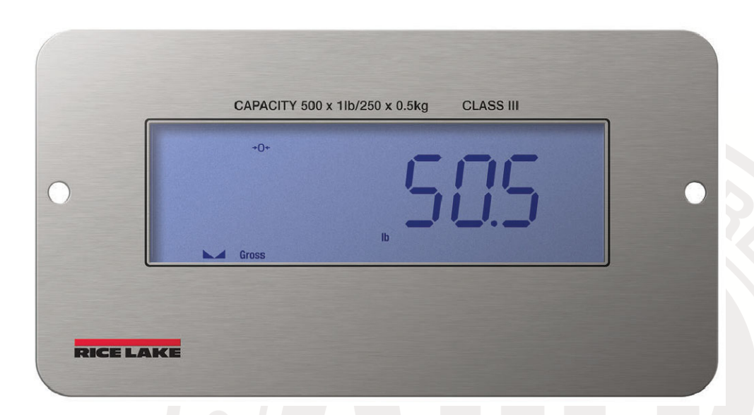
Sealing the TracerAV2