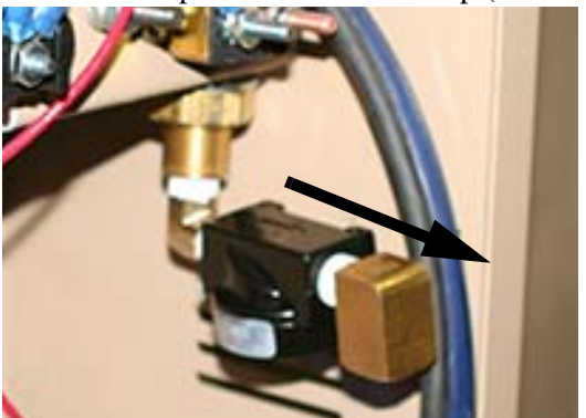
Direction of arrow