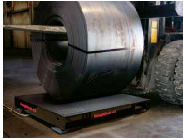
Above ground installation

Get the most from your RoughDeck CS Coil Scale with options and accessories like indicators and remote displays. Or customize your scale with coil cradles and v-tops to optimize your handling needs. The RoughDeck CS can be built to fit existing pit frames, or used in above ground applications.