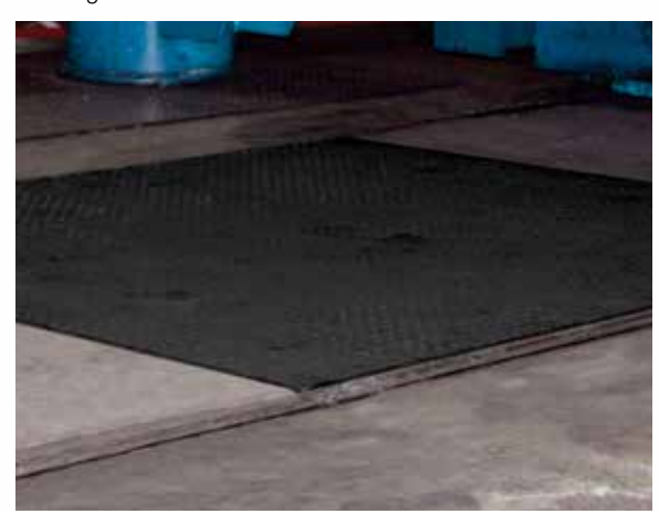
Pit mount installation