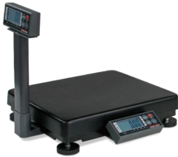
Model BP 1214-35P shown with standard ABS plastic weight platter, and optional pole mount and display

Featuring a variety of sizes, from 6 x 10 inches to 24 x 24 inches, and capacities from 15 pounds to 300 pounds, the BenchPro Series provides solutions for many applications. Select BenchPro models can be equipped with a roller ball or roller conveyor top for material processing. A powder coated, mild steel weight platter is available for use in dimensioning system integrations and other applications. The BenchPro is also able to interface with other software programs such as UPS WorldShip® and FedEx Ship Manager® using USB HID PC connection.