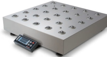
Model BP-1818 with ball top shroud