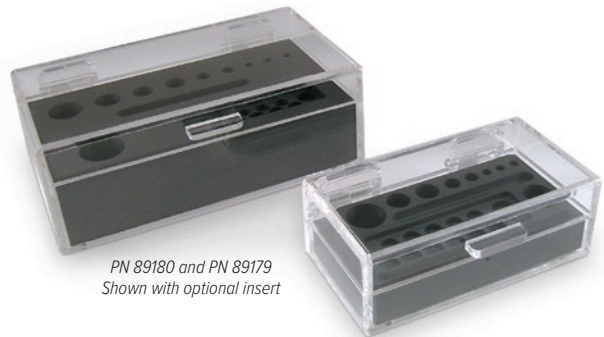
PN 89180 and PN 89179 Shown with optional insert