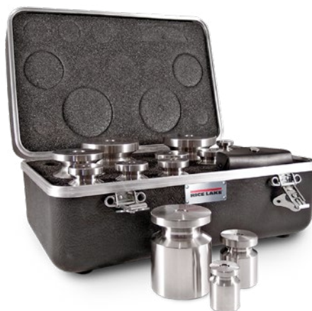
ABS Plastic Case (Weights shown are not included with case)