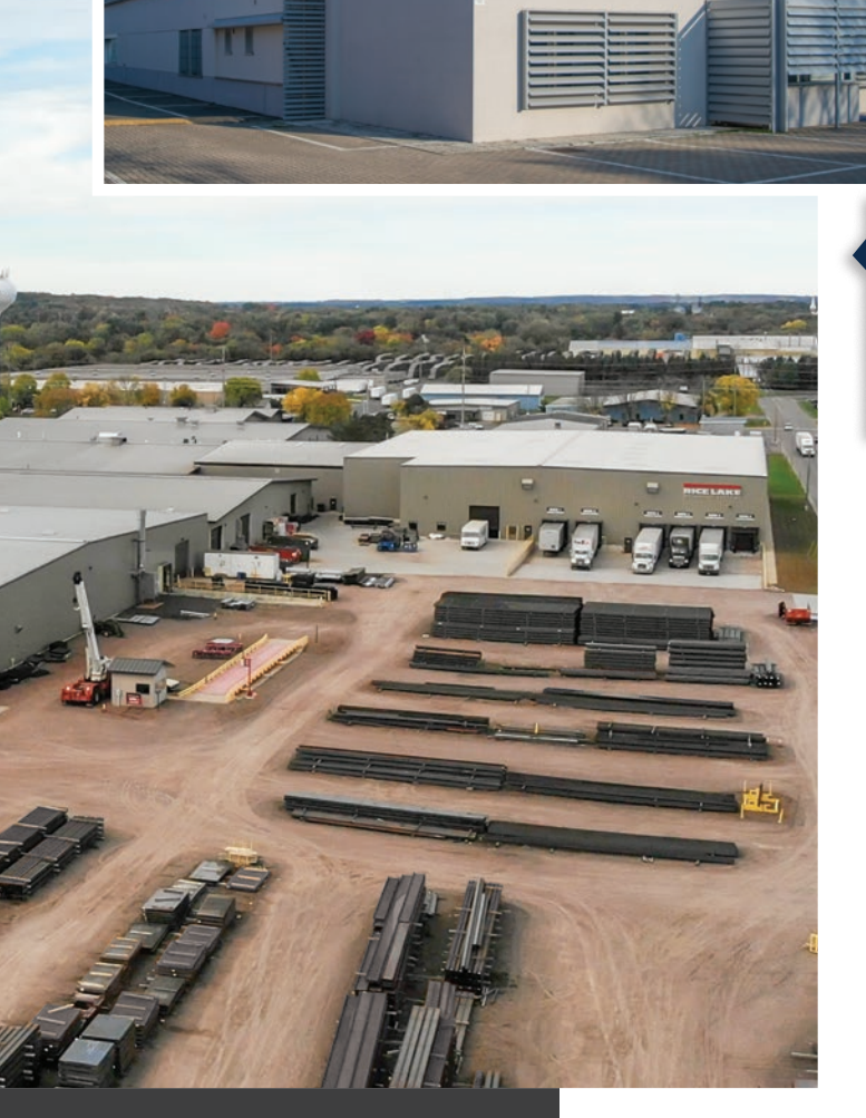
Rice Lake Weighing Systems' headquarters and primary manufacturing plant in Rice Lake, Wisconsin, USA leads the industry in technological advances and quality product manufacturing.