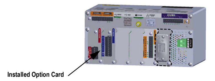
Figure 2-4. Installed Interface Option Card