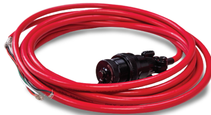
PN 127556 Home-run cable