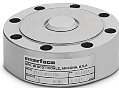
Picture is a representation of model 3211