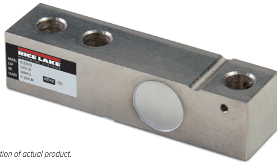
Picture is a representation of actual product.

Alloy Steel, Environmentally Sealed, NTEP Certified 1:5,000 Class III Multiple Cell, IP66