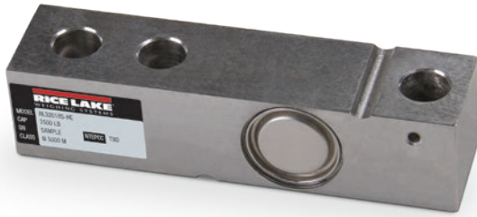
Picture is a representation of actual product.

Stainless Steel, Hermetically Sealed, NTEP Certified 1:5,000 Class III Multiple Cell, IP69K