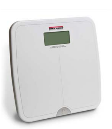
Figure 1. Adult & Child Scale