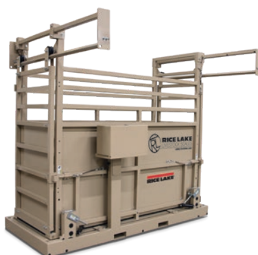
SAS shown with optional enclosure