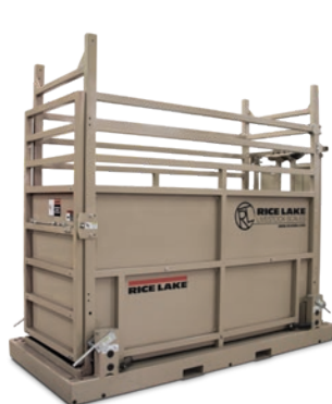
Swing gate option

The weigh center is mounted on the exterior of the cage for easy operation and viewing. A legal ticket can be printed and the weatherproof enclosure protects instrumentation. RATTLETRAP® digital filtering ensures stable weights even when animals are moving on the scale. The 920i Rate of Gain digital weight indicator software is the perfect addition to a system. The software allows up to 500 unique ID tag entries either manually or with an Allflex® AWR300 Series wand. The software tracks rate of gain by date and provides average rate of gain per day when two to three weights are entered for the same ID number.