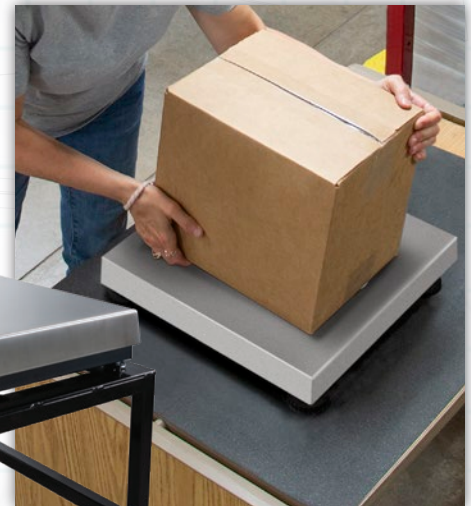
Bench scale shown with indicator and portability cart.