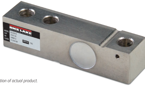
Picture is a representation of actual product.

Alloy Steel, Environmentally Sealed, OIML C3, IP67