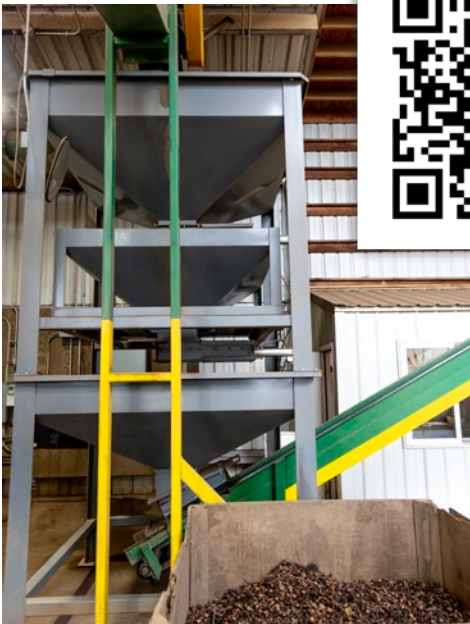
The RoughDeck® HS hopper scale