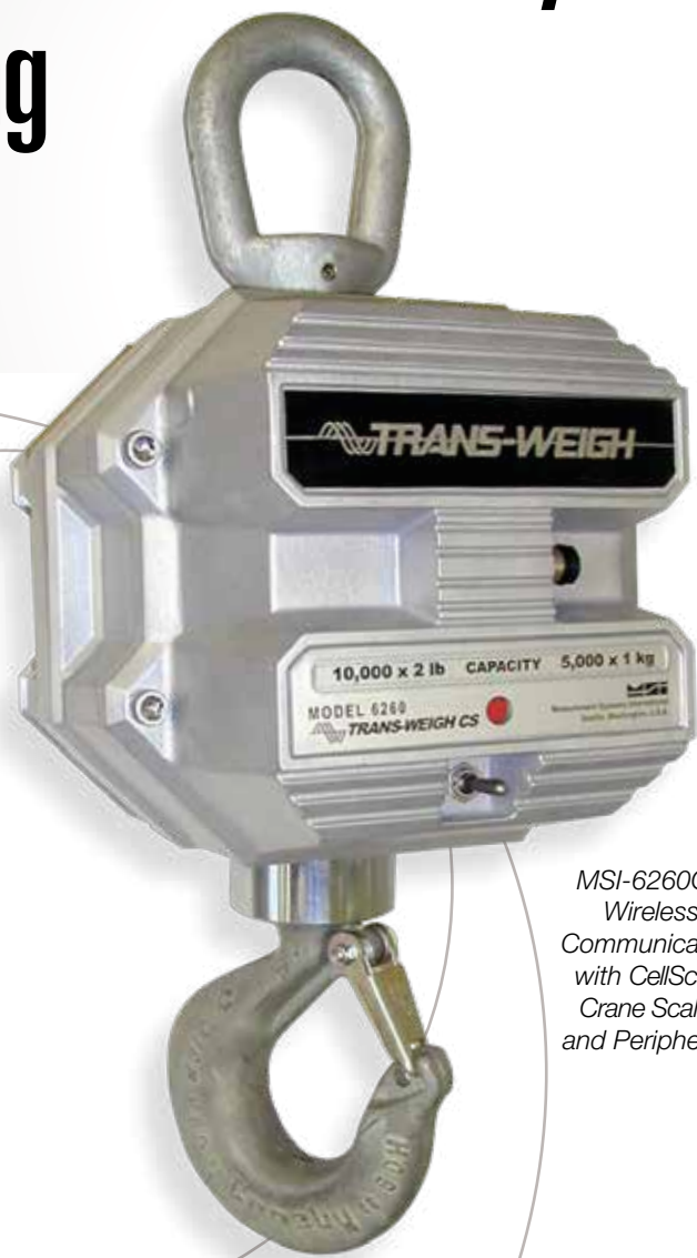
MSI-6260CS Wireless Communication with CellScale Crane Scales and Peripherals