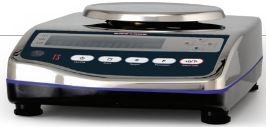
The 620g model is available in circular pan only.