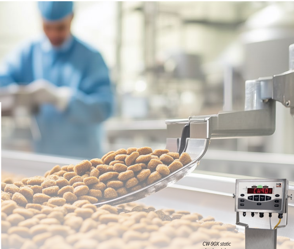
CW-90X static checkweigher