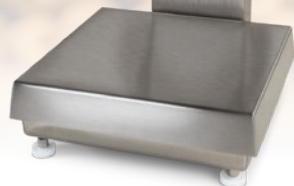
MotoWeigh in-motion checkweigher