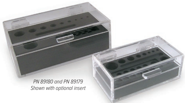
PN 89180 and PN 89179 Shown with optional insert